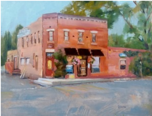
"The Laundry" by Allana Ruby on oil, 9x12, starting bid $100

Be in touch with Kim Grant to place an early bid at kgrant@coloradopreservation.org or by calling at 303-893-4260 x 222.