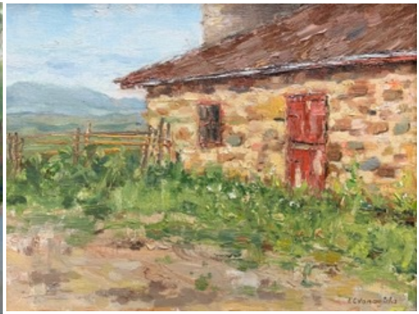
"Hogan Barn" by Lucy Yanagida on oil, 11x14, starting bid $150