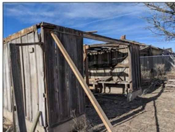
Early Blacksmith's Shop Stabilization 1/8/2020

Several important steps have been taken lately to preserve the fragile and vulnerable Dearfield African American Colony site, located east of Greeley and listed on Colorado's Most Endangered Places in 1999. Those interested in the preservation of the site, one of most significant sites in the West that tells of the story of the westward migration of black settlers in the late 19 th and early 20 th centuries, can thank the dedicated members of the Dearfield Preservation Committee for these efforts. Emergency stabilization and mothballing work, funded by a History Colorado State Historical Fund Grant, with CPI support, has been completed on the site for the Blacksmith's Shop and the rear of the Lunchroom at a workday held during Dearfield Days in late October. Additional work was delayed due to a major snowstorm but will resume on the Filling Station and O.T. Jackson House in the Spring. The work was carried out under the direction of Empire Carpentry with the help of CSU and UNC students and the Weld County Youth Corp.