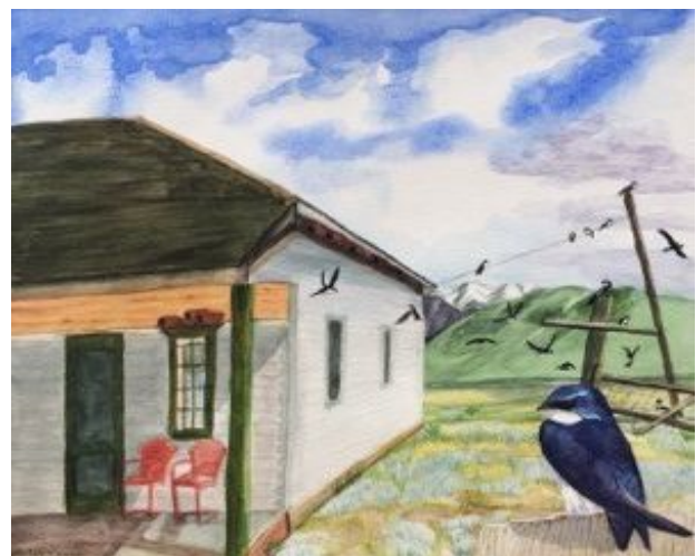
"Tree Swallows at Buffalo Peaks Homestead" by Keyes on watercolor, 18x12, starting bid $150