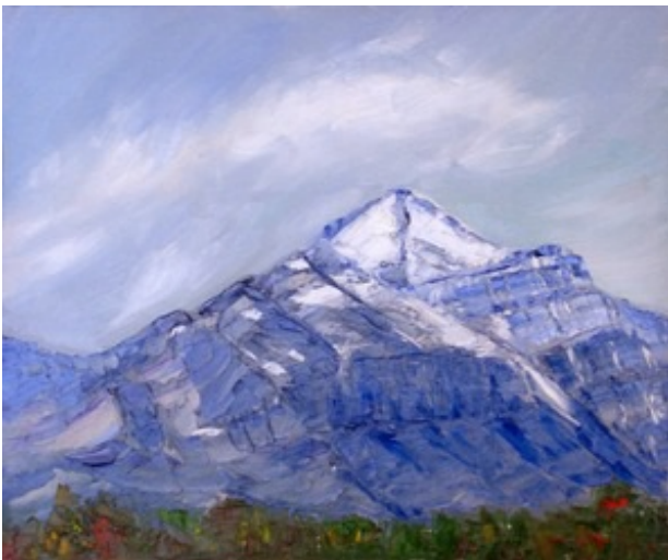
"LeBlues" by Anita Blythe on oil, 10x12, starting bid $150