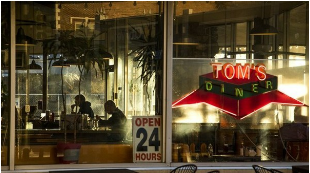
Breakfast time at Tom's Diner, East Colfax Avenue, Oct. 19, 2017.