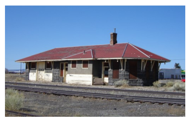
Listed in 2007