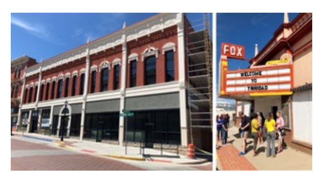
Listed as SAVED in 2020